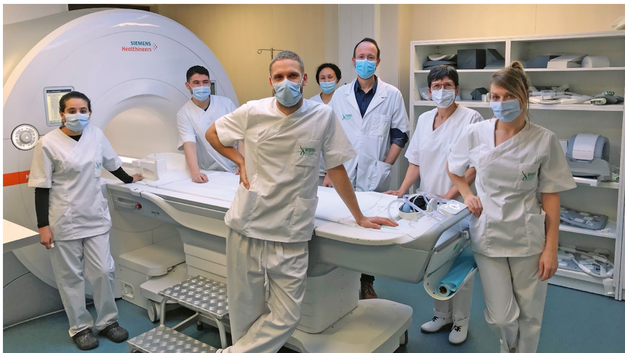
1 The team at Hôpital Saint Philibert, Lille, France

Many hospitals have had to adapt their processes because of the pandemic. Since the beginning of the pandemic, Siemens Healthineers has been working hard to find the best ways of responding to the situation. Its digital services have allowed the company to continue delivering all the support its customers need during this challenging period.